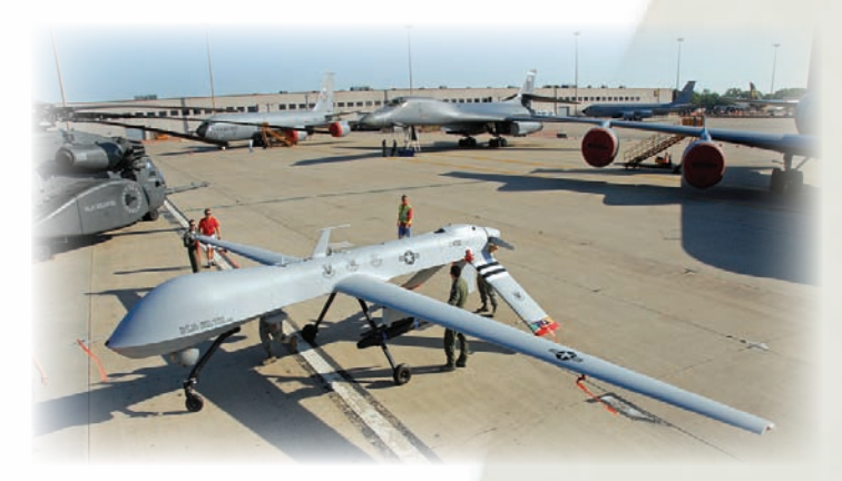
Figure 1. Drone Restriction Laws in the United States

Ten states have enacted laws that generally require a warrant for drone surveillance by law enforcement. These states are Florida,<sup>60</sup> Idaho,<sup>61</sup> Illinois,<sup>62</sup> Indiana,<sup>63</sup> Montana,<sup>64</sup> Oregon, <sup>65</sup> Tennessee,<sup>66</sup> Texas,<sup>67</sup> Utah,<sup>68</sup> and Wisconsin.<sup>69</sup> However, these